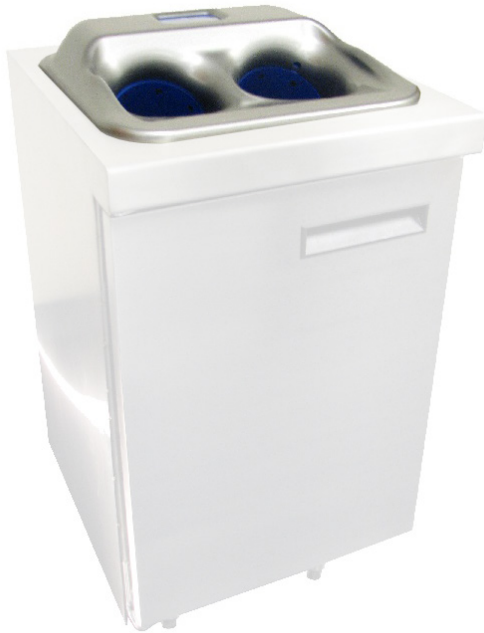
(Shown with optional stainless steel cabinet)