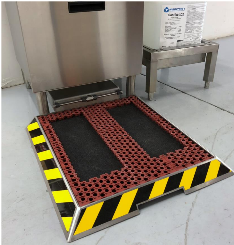
CleanTech 2000S w/ Sole-Clean